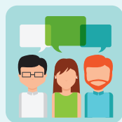
Understanding and use of receptive and expressive language